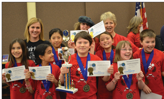
Grand Challenge winners: The Roaring Readers

This Grand Challenge Event went down to the wire with more than 100 parents and teachers cheering on the teams. The Roaring Readers from Bellevue's Woodridge Elementary School claimed the trophy.