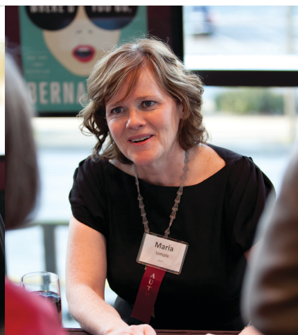
Author Maria Semple