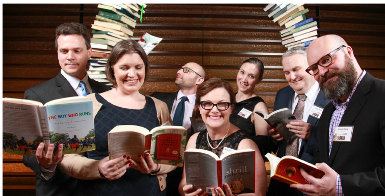
Gala attendees showing off their bookish side

wisdom in his unique deadpan style that his avid readers immediately recognized. The crowd jumped to its feet in a standing ovation as Handler concluded his remarks sharing "Libraries are our greatest solace and our greatest inspiration in this confounding world. And it is my honor to come and talk about them with you."