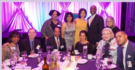
Guests of The Boeing Company with Author Lindy West

HarperCollins Publishers Hillis Clark Martin & Peterson P.S. Infobase Learning Ingram Content Group K&L Gates LLP Kauri, LLC KPMG MacDonald-Miller Facility Solutions Midwest Tape/hoopla digital The Miller Hill Partnership National Maintenance Contractors OverDrive PRIME Electric Puget Sound Energy PwC Reliance Fire Protection Washington Trust Bank