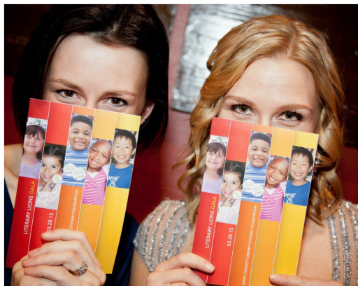
Literary Lions Gala attendees having fun.